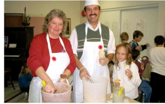
PARENTS IN THE CLASSROOM