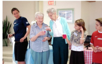
SCIENCE CENTRE OUTREACH