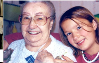
VISITING WITH GRANDMA