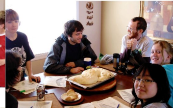
SIERRA CLUB EDUCATES ABOUT FOOD ORIGINS