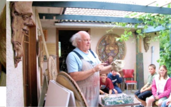
PROFESSIONAL ARTIST INSPIRES