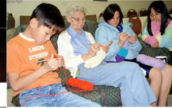
CROCHETING AND CRAFTS