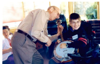
MUSIC CONNECTS US ALL