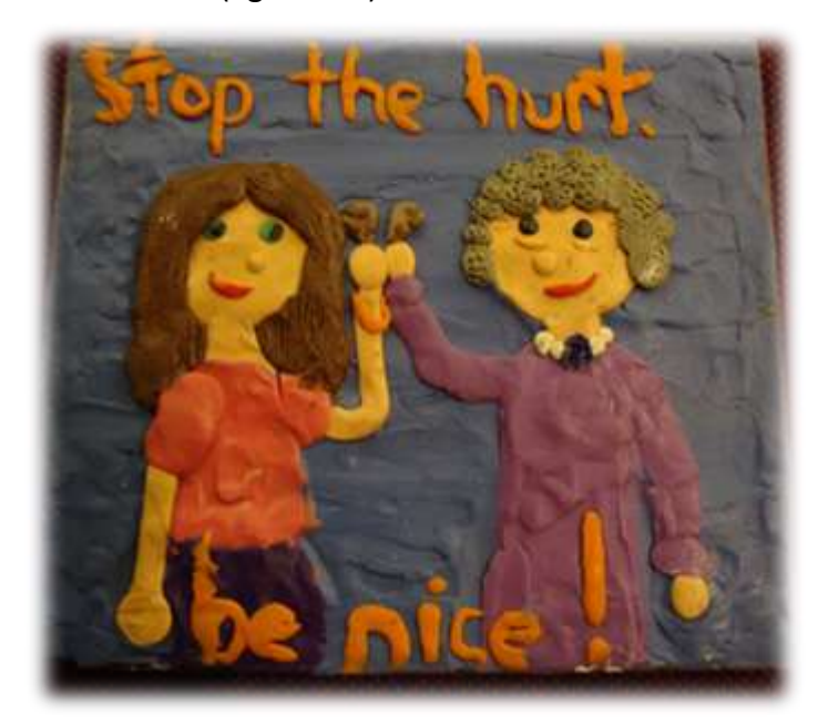
Plasticine poster on bullying done by an 8-year old.