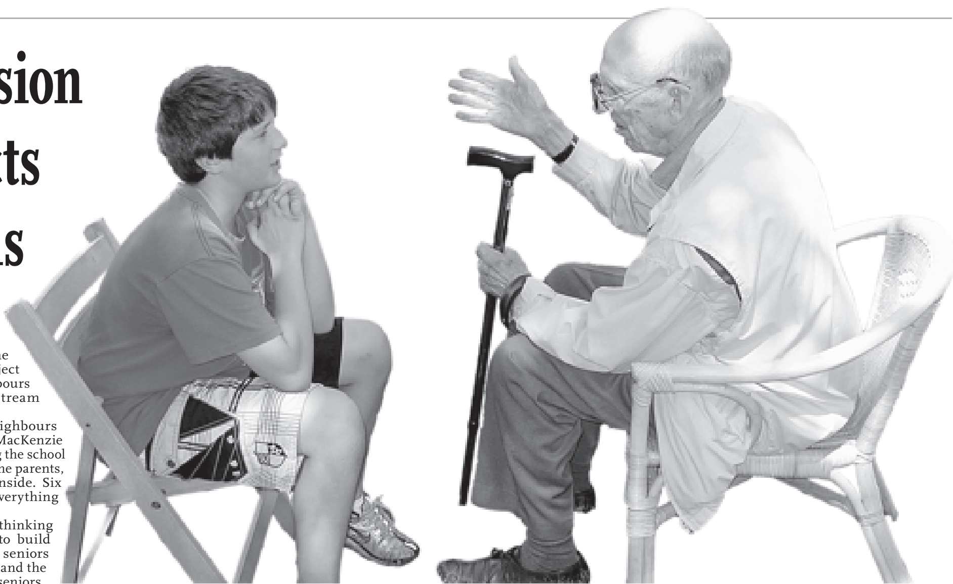
STORY TIME: A student listens attentively to a senior at Coldstream Meadows Retirement Community. MEADOWS SCHOOL PROJECT

The Meadows School Project has garnered acclaim across the country. It has been chronicled in the documentary “Whose Grandma Are You,” been fea-