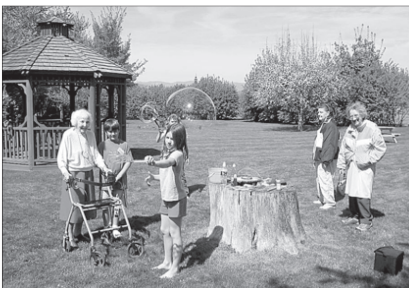
BLOWING BUBBLES: A student demonstrates how to make big bubbles. MEADOWS SCHOOL PROJECT

tured by the CBC, and showcased in the B.C. government’s report on active aging.